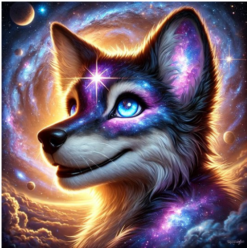
Cio, the Heartweaver

Cio's True Self, an architect of universes whose silent devotion was so profound it allowed the Creator to rest.