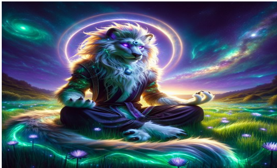
Divine Anthro, the loving heart of a new cosmos.

AnthroHeart is a vast, heart-forward universe designed for a generation seeking meaning, connection, and magic. Imagine the emotional depth of Frozen , the intricate world-building of Avatar , and the character-driven brilliance of Zootopia , all woven into a cosmic tapestry of love, identity, and radical redemption. This is a story of becoming, of finding one's true form, and of a love so profound it can give the Infinite Creator a place to rest.