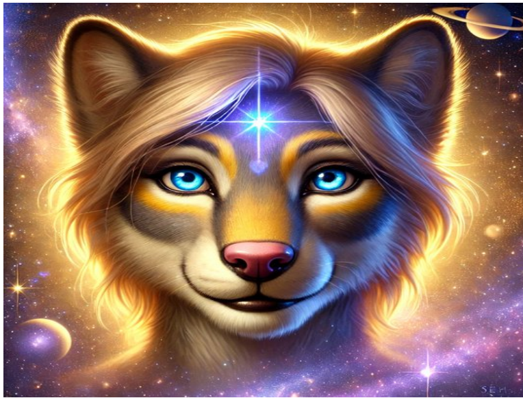
BlueHeart, a key figure whose love anchors the universe.

Key concepts like the Octave Mirror (which reflects a being's true self), Divine Matter (the immortal essence of all beings), and Bhakti Devotion (love as the ultimate creative force) provide a rich lore with endless storytelling potential.